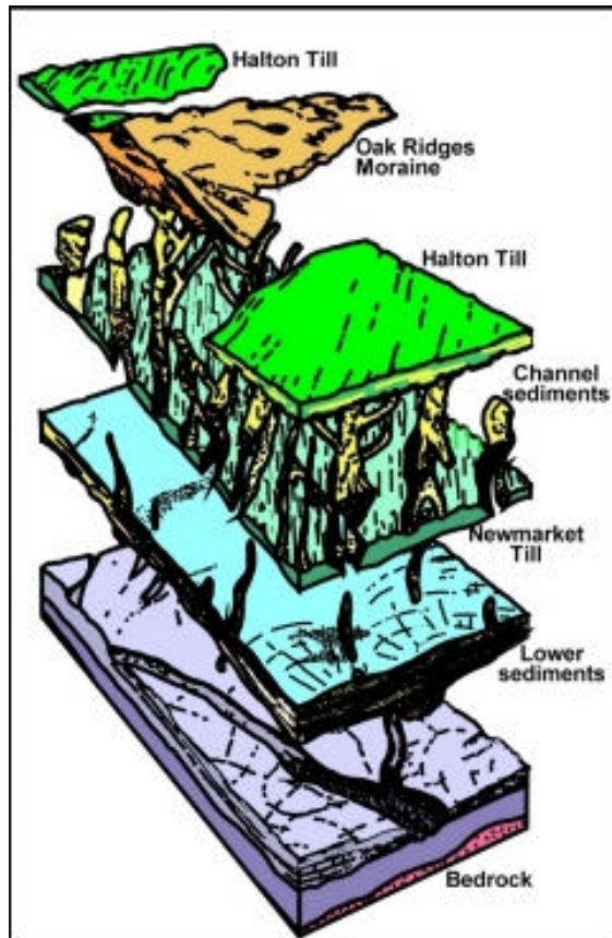
Figure 3: Geological structure of the Oak Ridges Moraine

The basic facts regarding the moraine's geology and aquifer are well known (Figure 3), including the role of the moraine in recharging streams and rivers in the region (Desbaretts et al. 2000). Despite a decade's research, however, many uncertainties remain in our knowledge of its hydrology, and its role in the regional ecosystem. For instance, lack of quantitative data on shallow local flow systems hinders estimation of flow from the aquifer into surface waterways (Grannemann 2000).